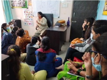
Talking to a Self Help Group

In our sustained effort to reduce late stage diagnosis through information and awareness, various discussions and camps were organized. The pandemic has affected our efforts but we try in various ways to reach out to the community.