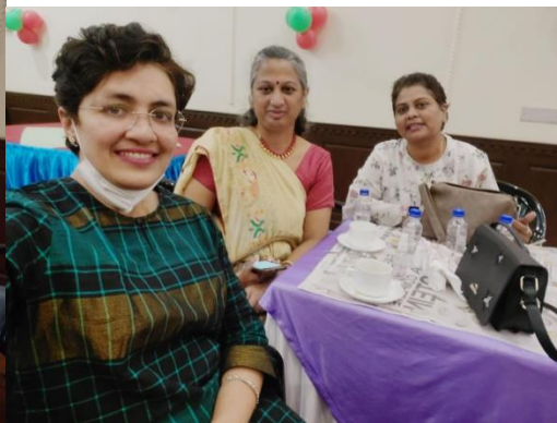
Our offline support group meeting